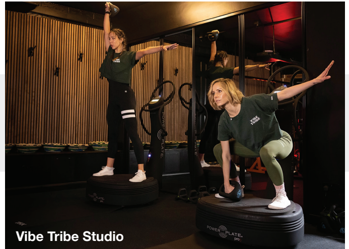
Vibe Tribe Studio

On the first floor, a clinic offers chiropractic services, manual lymphatic drainage and sports massage to complement the blood flow and lymphatic benefits of Power Plate training.